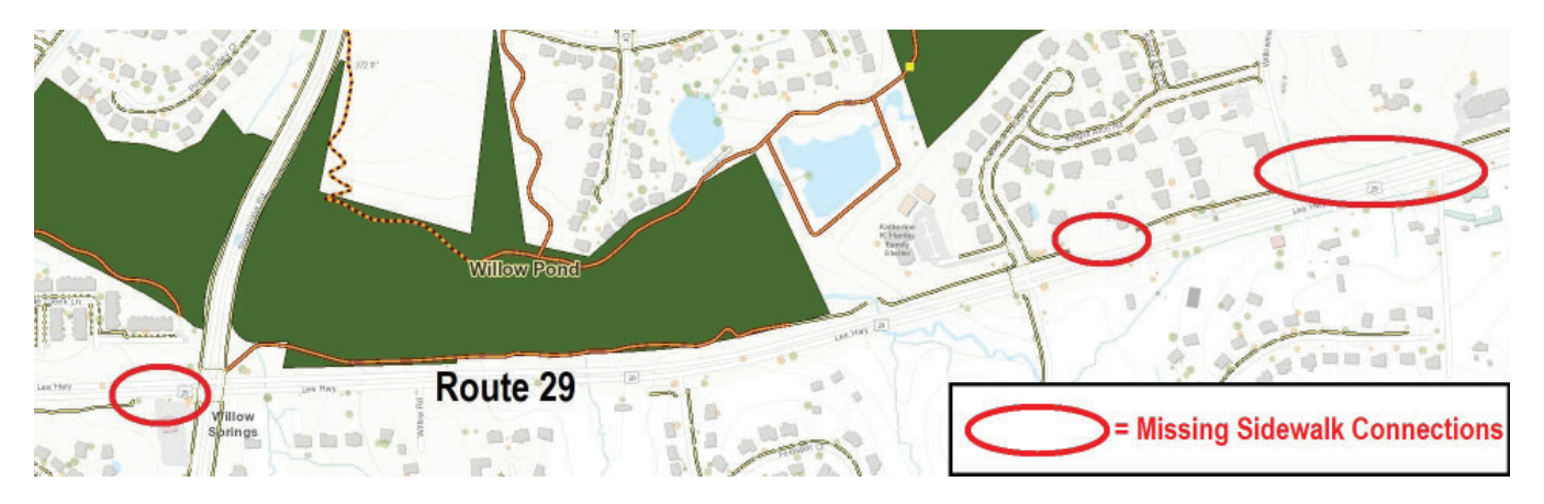
Figure 3.5.3 Early Completion of Missing Sidewalk Connections

■ Maintenance of Temporary Drainage: Often overlooked in a work zone is maintenance of existing drainage to avoid the potentially dangerous condition of ponding water and/or ice buildup in the travel lanes during construction. Where proposed profile adjustments will require the roadside to be above existing pavement elevations, one technique we have utilized successfully to avoid ponding of water is to employ temporary asphalt to flip the cross-slope to convey water to the opposite side of the roadway. By diverting flow away from the higher area, concerns associated with ponding of