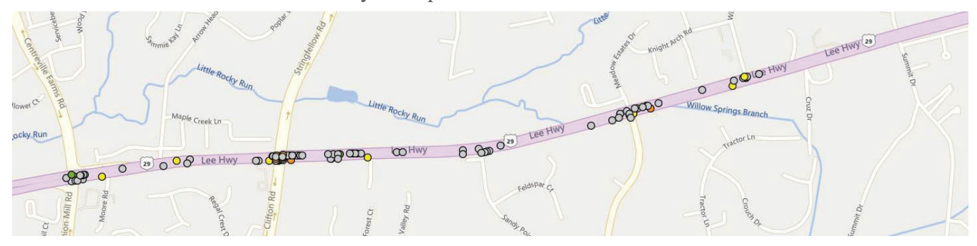
Figure 3.5.2 Crash Map

■ Utilize Site-Specific Enhanced Safety and Mobility Strategies: These can significantly improve traffic operations and safety during construction. We know that between 2016-2021 there have been 141 crashes within the Project limits, as shown in Figure 3.5.2. We have identified the following enhancements to maximize safety and operations: