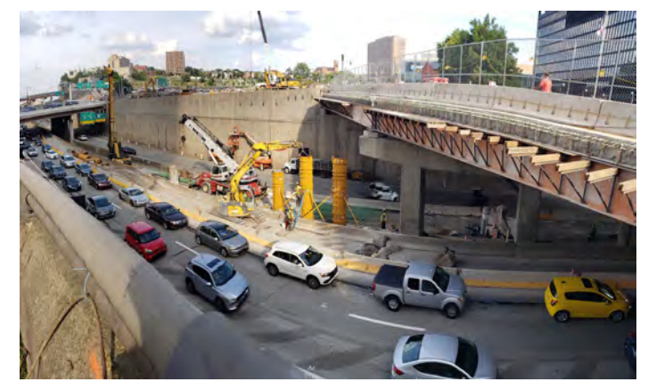
MD 85 (Phase 1) at I-270 Interchange Reconstruction: Fay is replacing the existing I-270 twin bridges over MD 85 in Frederick, MD, increasing the vertical clearance. Work includes building a new three-span, 450' long and 120' wide structure. The 1.5 miles of MD 85 roadway reconstruction is lined with

*I-579 Capping and New Bridge Construction: Fay is constructing a three-acre public park to connect a historic neighborhood to downtown Pittsburgh. This bridge-like structure over I-579 will add a much-needed recreational space, rain gardens and multi-modal access including bicycle pedestrian paths and a link to the subway station. Construction of this bridge required installation of more than 1,000,000 pounds of rebar and 126 box beams, each weighing 140,000 lbs.