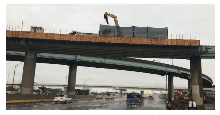
Demolition over I-95 in Philadelphia Betsy Ross Bridge

for bridges. He is currently overseeing the Betsy Ross over I-95 demolition in Philadelphia and has been responsible for demo activities on notable bridges for several state DOTs such as the Cleveland Innerbelt. Clint will direct the use of demolition strategies including, but not limited to, slot/saw and lift operations (over roadways) or controlled drop (over approaches) for removal of existing decks.