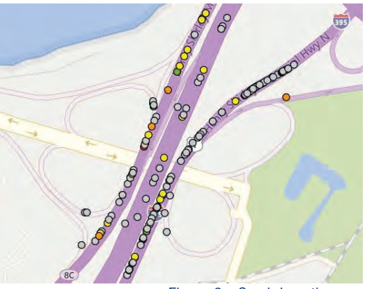
Figure 2 - Crash Locations

This strategy will improve traffic operations and safety during construction and begins with studying the pre-construction safety concerns and crash statistics, and then incorporating safety and operational enhancements into the MOT plans to maximize safety. A preliminary investigation and assessment has already been completed by our Team, and has identified 161 documented crashes within the Project limits, as shown in Figure 2, between September 2017 and August 2020. We have identified the following innovative enhancements that will maximize safety and operations: