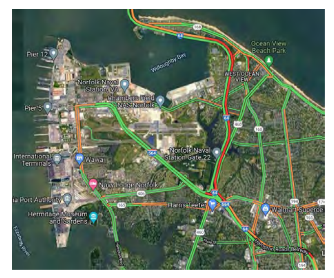
Figure 1: Afternoon Peak Congestion on WB I-64 Within Project Limits

For any incidents, we know the critical importance of quickly detecting and clearing the travel lanes. In addition, due to the severe congestion on I-64 particularly in the westbound direction towards the HRBT in the afternoon/evening peak, combined with construction impacts associated with this Project, cut-through traffic off of I-64