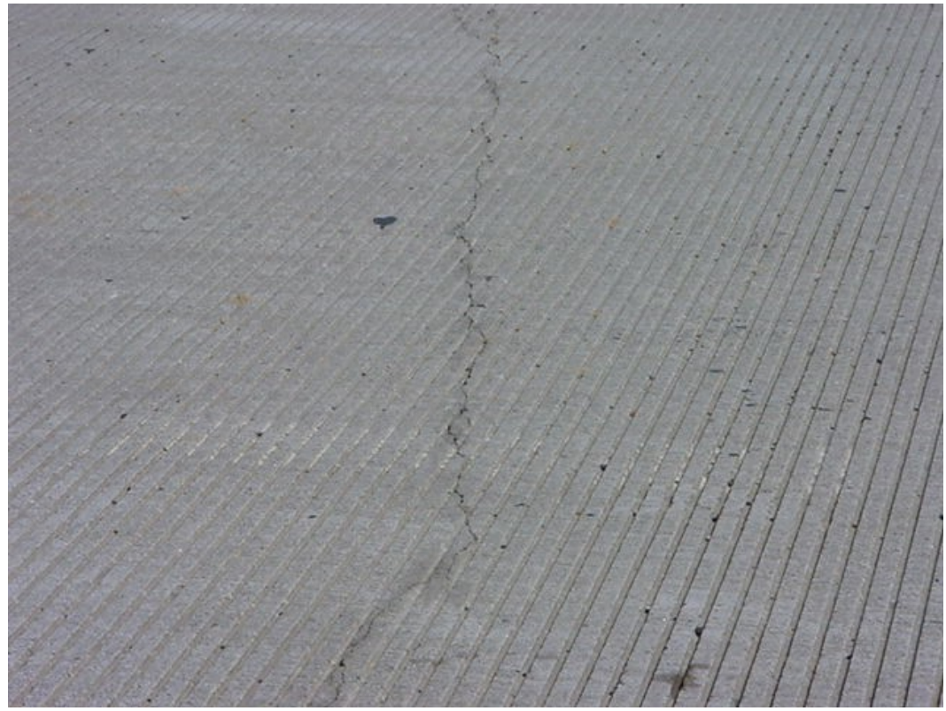
Figure 2 Deck with transverse linear cracks.