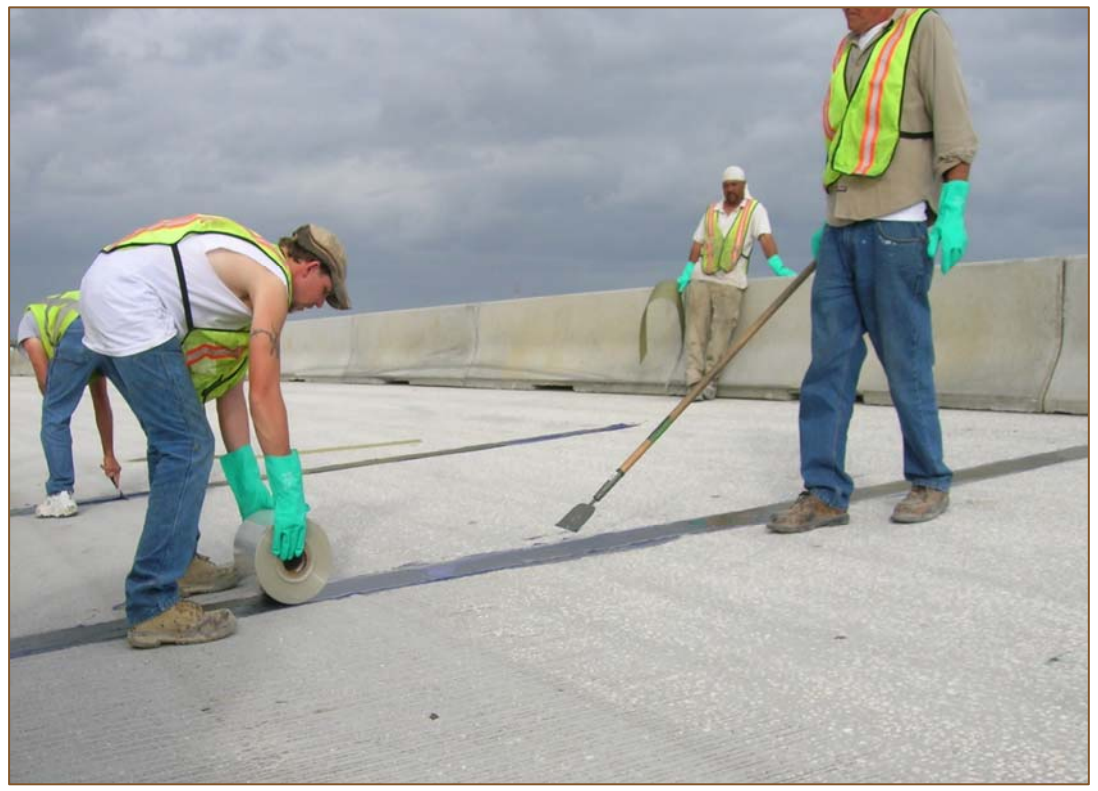
Figure 6 Carbon fiber mesh repair. Epoxy is placed on the deck surface along the crack. The carbon fiber mesh is rolled into the epoxy.