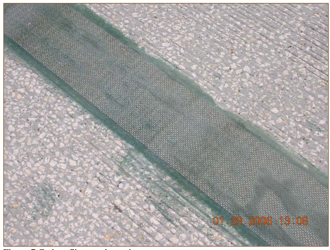
Figure 7 Carbon fiber mesh repair.