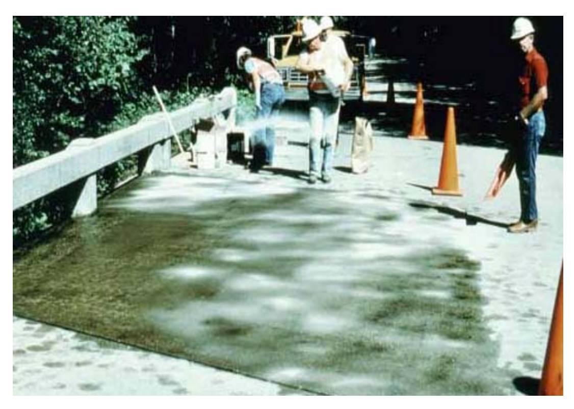
Figure 5 Sand being broadcast into the polymer to provide an acceptable skid number.