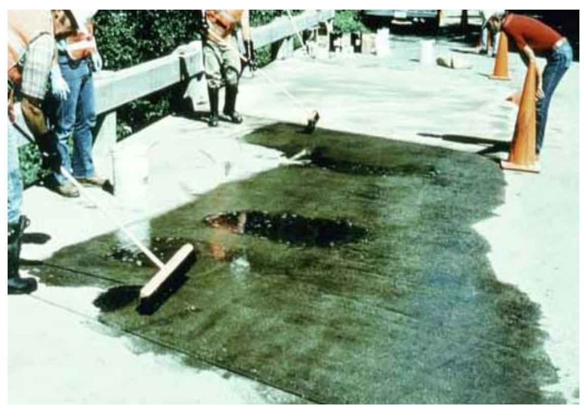
Figure 4 Pattern cracks in a deck being filled with a gravity fill polymer.