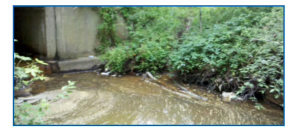
Natural foam in creek - not and illicit discharge