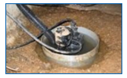
Basement / Crawl Space Sump Pumps