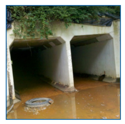
Presence of iron bacteria in culvert, as well as in stream Note the orange-brown color