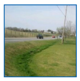
Septic / Sanitary Sewer Discharges