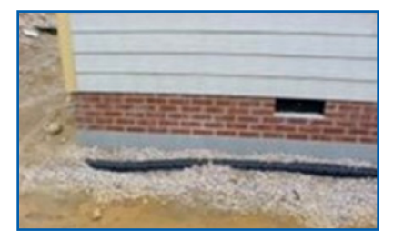
Foundation / Footing Drains