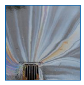
Discharge of Oil, Fuel from Vehicles and Equipment