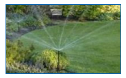
Landscaping Irrigation and Lawn Watering