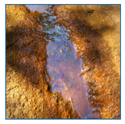
Two examples of iron bacteria Note the raindow sheen