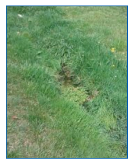
"Close up" of ditch where a sewage smell was repoted

The source of this illicit discharge was determined by following the smell and excessive vegetation in the ditch line to a sewer manhole. The two pictures were taken in the spring. The grass in the yard had not yet come out of winter dormancy, but the grass in the ditch line was three times as tall, and was much greener than the yard