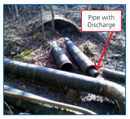
"Big Picture" photo showing pipe and surrounding layout