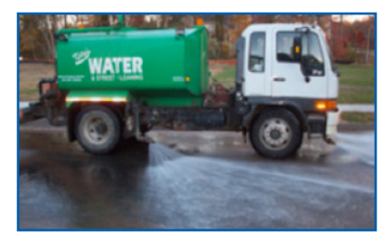
Street Wash Water