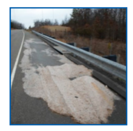
Mismanaged / Excess Road Salt