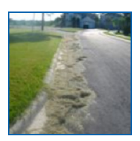
Grass Clippings and Leaves when Intentionally Blown Into Drains