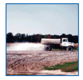
Fertilizer, Pesticides and Herbicides - Misapplied or Overapplied