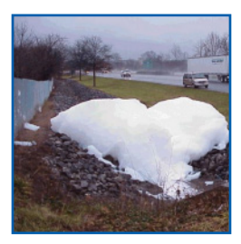
White foam in ditch - this is manmade in origin and would be considered an illicit discharge

Foam that is white in color and has a sweet or scented odor is likely to be manmade Examples of these include detergents, soaps and shampoos Always check the surrounding area for possible sources when foam is observed