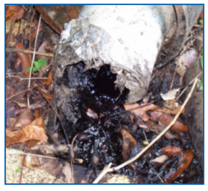
"Close up" of discharge of oily substance from pipe

In addition to close-up detailed photos, also take photos that capture the outfall and surrounding area ("Big Picture") A "Big Picture" photo provides a frame of reference for anyone who has to perform a follow up investigation at the site