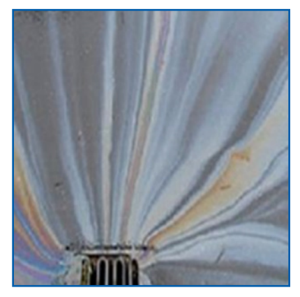
When disturbed, a petroleum sheen swirls and reforms