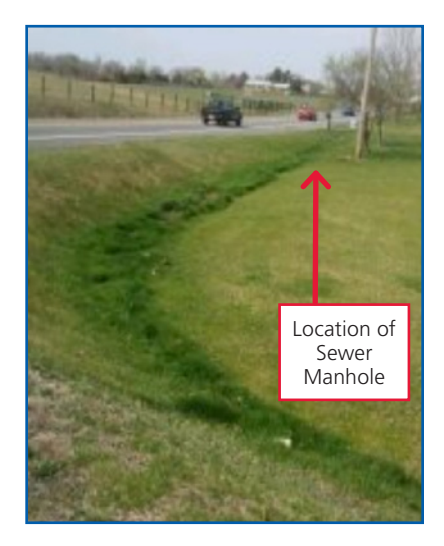
"Big Picture" of ditch line