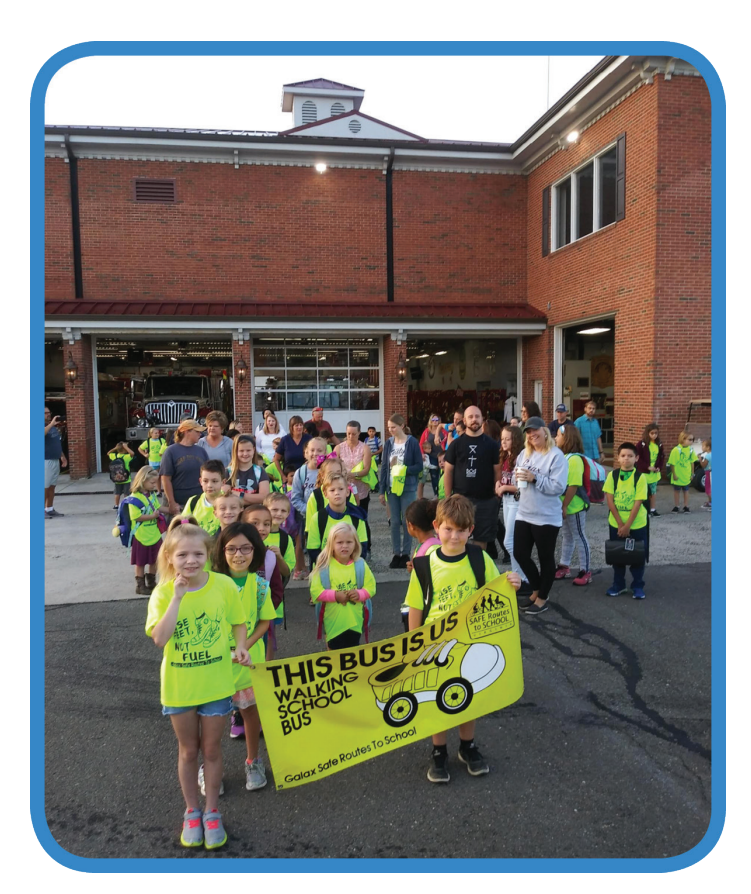
A walking school bus in Galax.

On the following page are some helpful Walking School Bus resources: