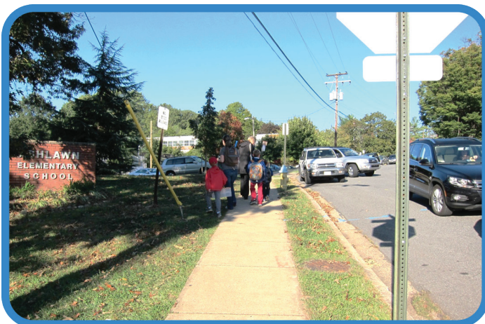
Sidewalks should be wide enough to accommodate small groups of pedestrians walking together.