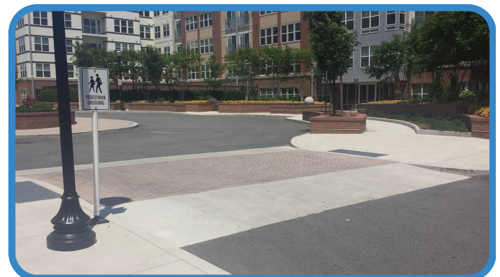
A sidewalk-level driveway crossing.