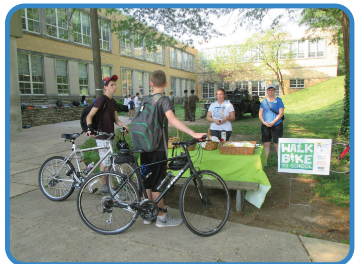
Incentives for walking and biking to school can be one piece of a school TDM program.

Transportation Demand Management (TDM) might be the alternative. It's a set of strategies or policies that looks at how people make transportation decisions and helps them take advantage of the options they may have, including travel modes other than driving. The idea is to maximize the existing transportation infrastructure, rather than creating new facilities that can be costly to build and maintain.