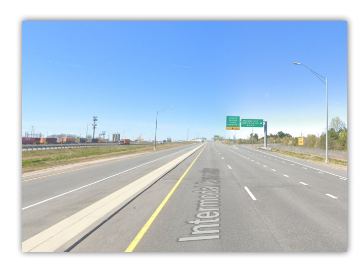
Westbound Intermodal Connector approaching Public Connector Road