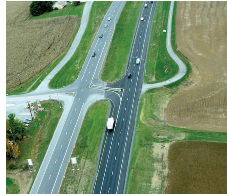
Frederick County, MD RCUT Intersectio