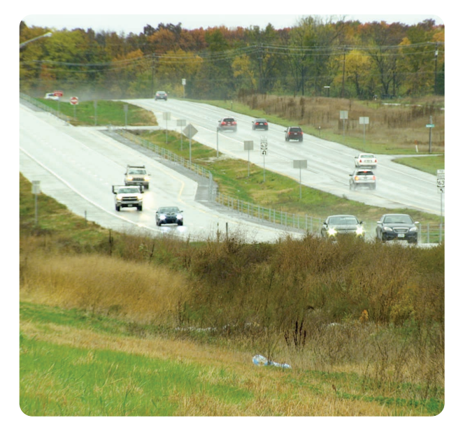
Boone County, MO RCUT Intersection

An RCUT also can support community goals for pedestrians and bicycles. Provisions for walking and biking must be considered throughout the project development process, with the needs of pedestrians and bicycles shaping the overall design of the RCUT accordingly. This includes pedestrian crossings that are accessible to all users, and when signalized, phases that accommodate both pedestrians and bicycles. The channelization used in the RCUT design can serve as effective refuge islands for pedestrian crossings and/or as bicycle queuing areas.