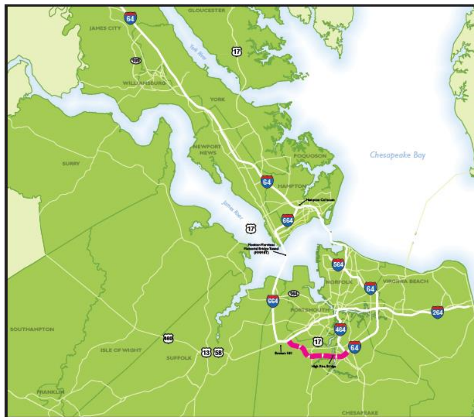
Figure 1 – Location Map

The study area for the 2013 I-64/High Rise Bridge Corridor Study was located in the southwestern quadrant of the Hampton Roads Beltway, which is formed by a loop of I-64 and I-664 (see Figure 1 ).