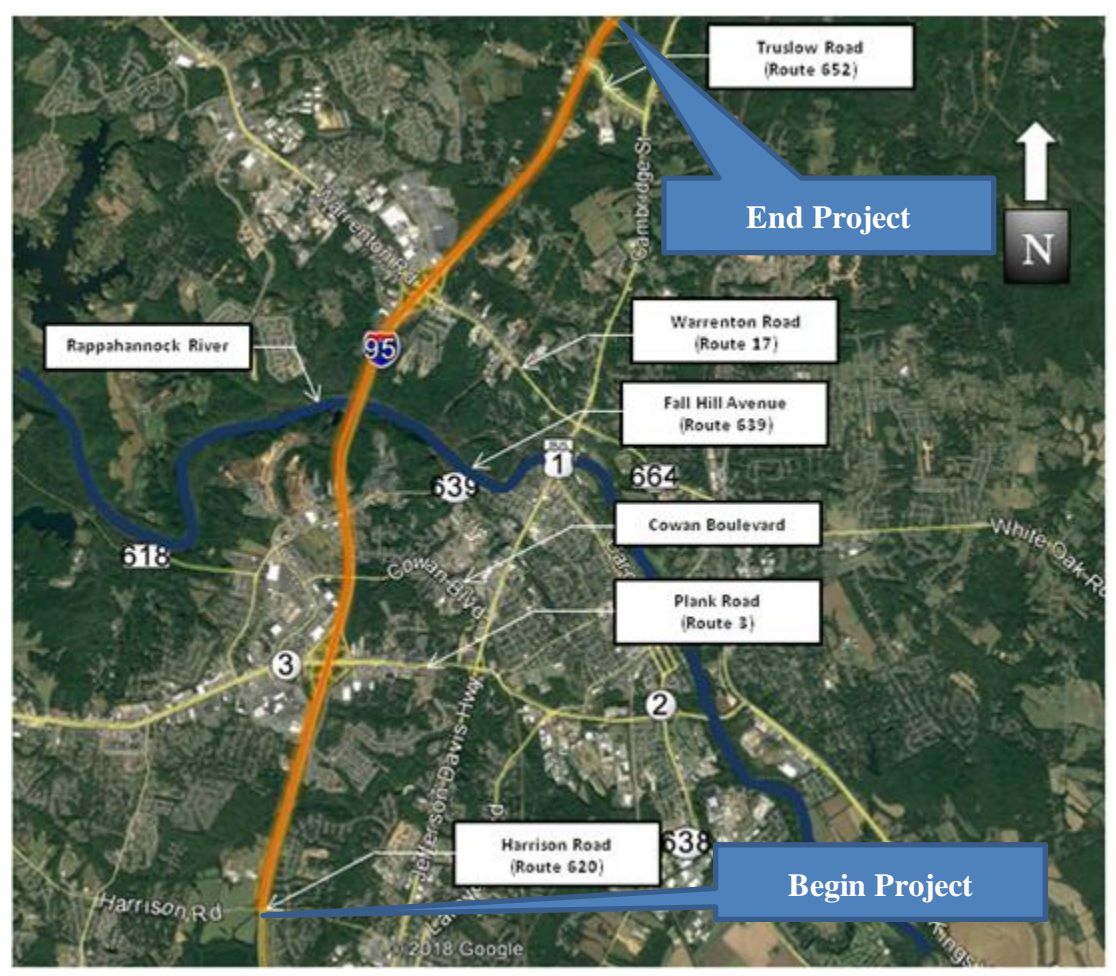
Figure 2: Project Limits

southbound bridge. The project seeks to reduce congestion on I-95 by providing local traffic with an additional route to travel between Route 17 and Route 3 without merging into the interstate's general purpose lanes. Traffic traveling south on I-95 can choose to enter either the three new general purpose lanes that will be built in the median of I-95, or the CD lanes. The entrance to the new lanes will be located just south of the Truslow Road overpass in Stafford County.