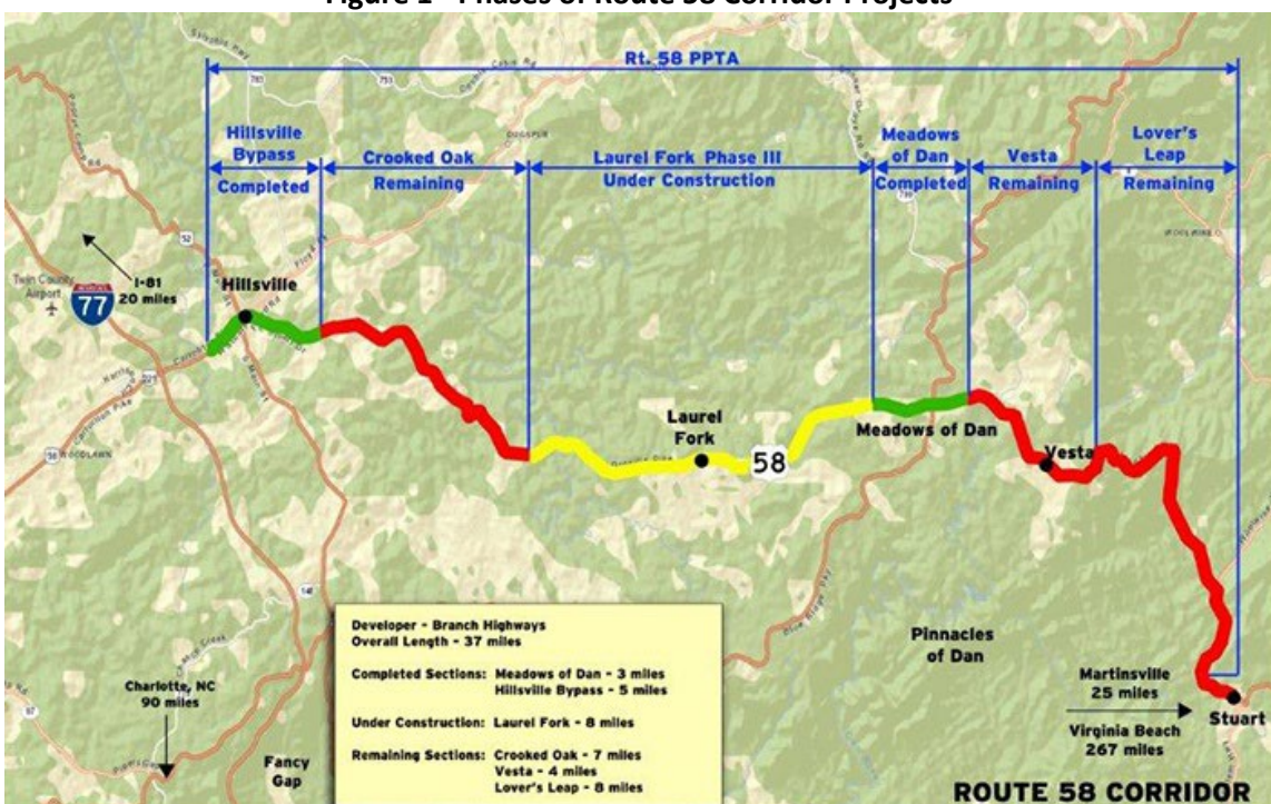
Figure 1 - Phases of Route 58 Corridor Projects

There is approximately 19 miles of roadway left in the three remaining phases of this Project excluding the secondary connector, Route 669. The original plans developed prior to 2001 are at 40% to 60% complete. Work stopped in 2001 following receipt of the PPTA proposal. Environmental permitting activities with regulatory agencies are incomplete and significant work remains in this area. The final project to be constructed with the PPTA agreement is the Lovers Leap section. Figure 1 shows the geographic area of the original phases.