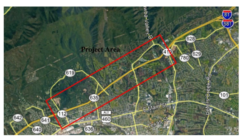
FIGURE 2: GEOGRAPHIC AREA

The 2018 I-81 Corridor Improvement Plan (CIP) Project IDs 39A and 39B are located along I-81 between mile markers (MM) 136.6 and 141.8 and grouped under UPC 116203. The project is located within Roanoke County and the City of Salem, as the city corporate limits straddle I-81 through this portion of the corridor. The project begins about 3,000 feet south of the I-81/Rt. 112 (Wildwood Rd.) interchange (exit 137) near the I-81 over Rt. 641 (Texas Hollow Rd.) bridges and ends about 1,800' north of the I-81/Rt. 419 (North Electric Rd.) interchange. Figure 2 shows the general geographic area of the project.