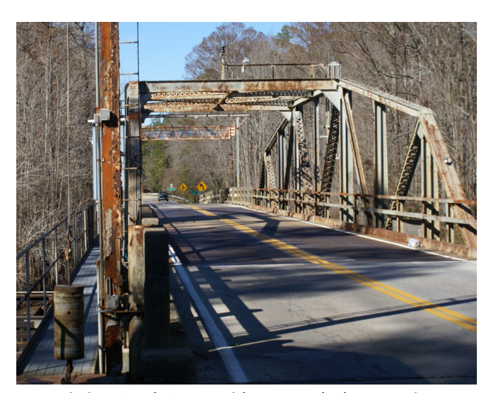
Existing South Quay Bridge over Blackwater River.