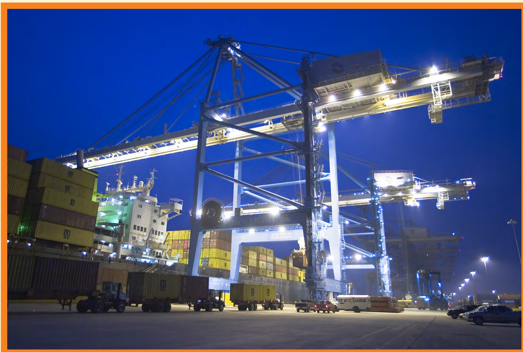
Port Operations / Economic growth