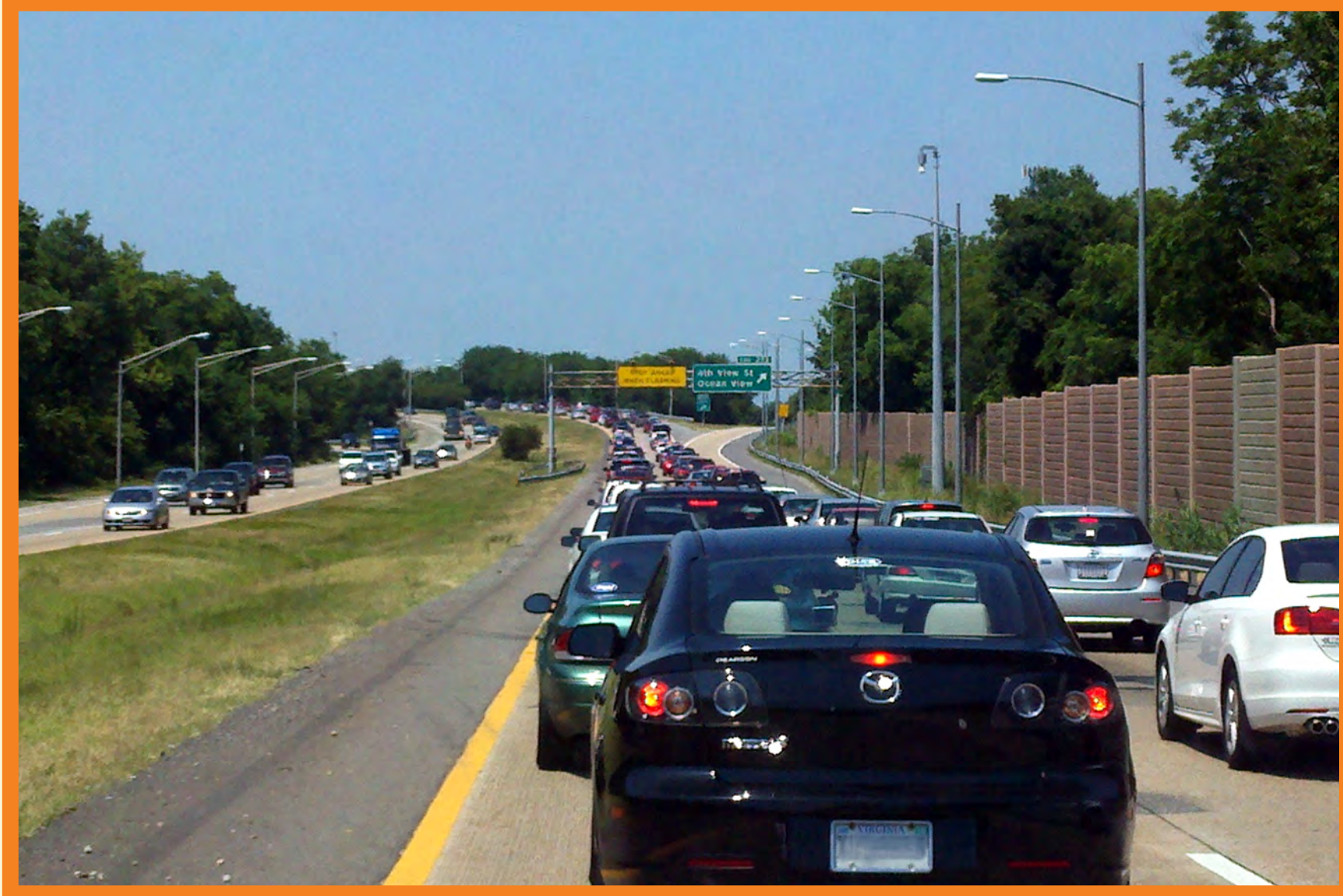
Roadway Congestion / Travel Delays