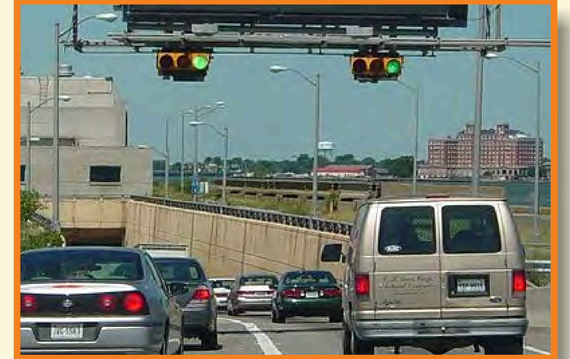
Bridge Tunnel Operational Efficiency