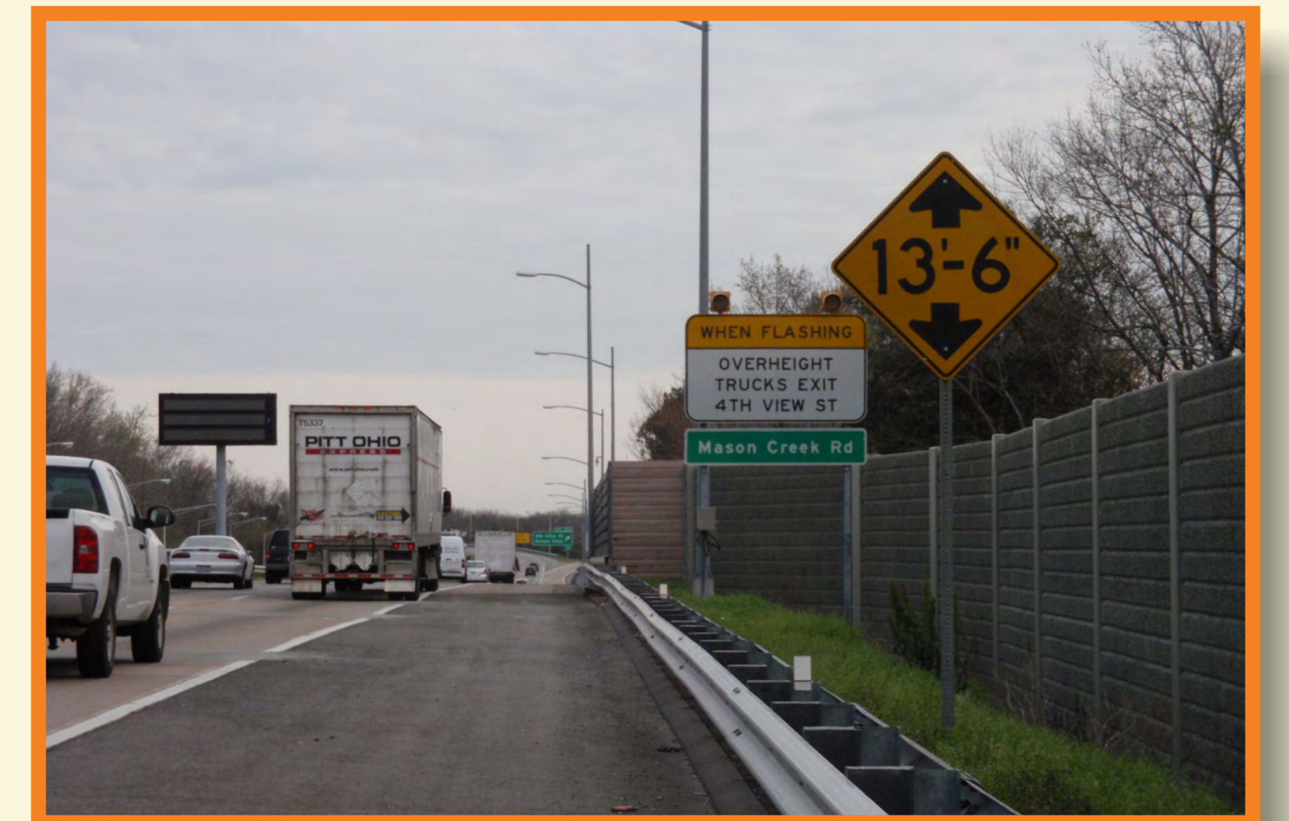
Tunnel Vertical Clearance